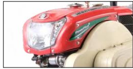
State Of The Art Led Head Lamps