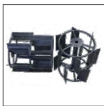
Paddy Cage Wheel