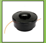
Tap & Go Cutter