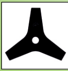
3 Point Blade