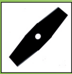
2 Point Blade