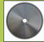
TCT Blade (80 Teeth)