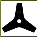
3 Point Blade