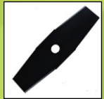
2 Point Blade