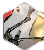
8+2 HEAVY DUTY TRANSMISSION