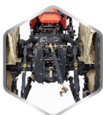
1800 KG LIFT CAPACITY