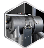
DRY TYPE AIR CLEANER