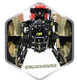
ROBUST REAR AXLE