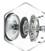
DUAL DIAPHRAGM CLUTCH