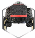
BOW TYPE FRONT AXLE