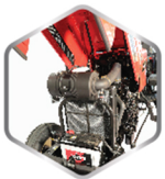
PNEUMATIC ASSISTED FRONT OPENING HOOD